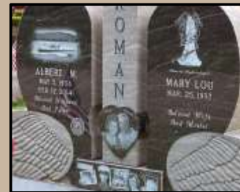
EPITAPHS & SAYINGS