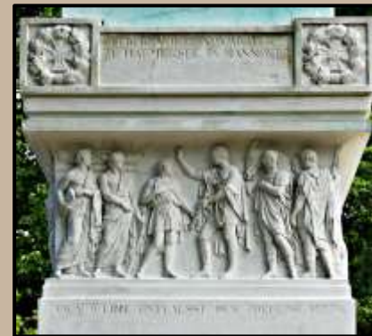
BAS RELIEF SCULPTURE

A sculpture is any three-dimensional piece of art created by carving, removing material, or modelling (adding material). Custom sculptures include statues or columns. They can simply be a decorative addition to a granite mausoleum, or they can be a symbol or image with special meaning to the family. Sculpture can have religious imagery or symbols representing your family's nationality.