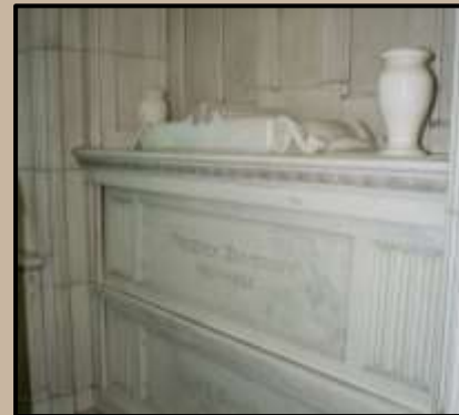
CRYPTS FOR CASKETS

Walk-in Mausoleums allow families to visit in comfort year-round. They also provide indoor spaces for you to decorate or use for other purposes. In addition to the crypts and cremation niches that open to the inside of the mausoleum, walk-ins can have one or more rooms to display family memorabilia and art. Some people like to have a chapel room dedicated to prayer and remembrance.