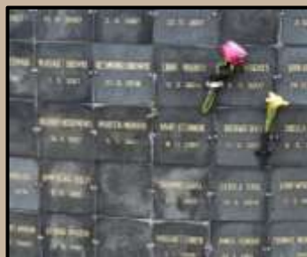
NICHE DOORS, LETTERING & ART