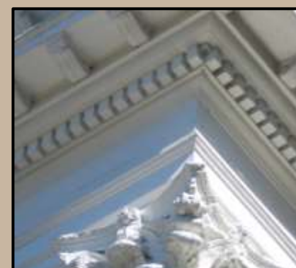
DENTIL DECORATIVE SCULPTURE