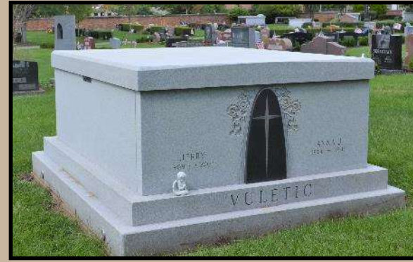
DOUBLE OR COMPANION CRYPT LAWN STYLE MAUSOLEUMS are generally for spouses. They can be side by side, front and back, or one atop the other.