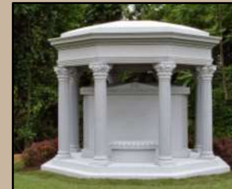
GARDEN/OUTDOOR MAUSOLEUMS have no interior space. The crypts/niches are on the outside.