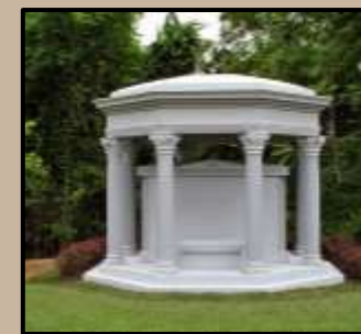
GARDEN STYLE: FROM $200,000