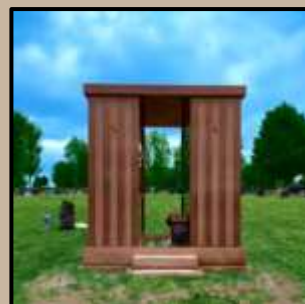
WALK-THROUGH WITH 6 CRYPTS: FROM $72,000