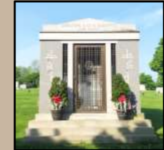
VESTIBULE: FROM $145,000