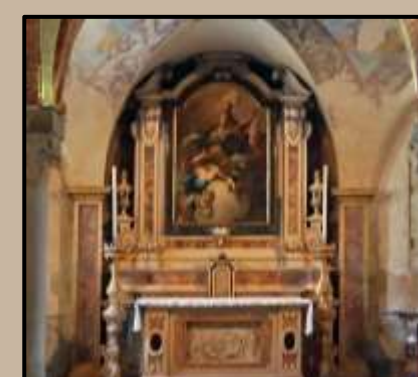
WALL ART & PAINTINGS