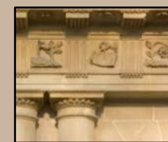
FRIEZES, COLUMNS & CROWNS