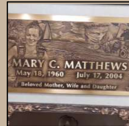
COMMEMORATIVE BRONZE PLAQUES