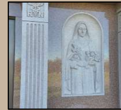
ENGRAVED IMAGES & SYMBOLS