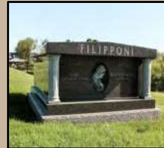
2 CRYPT: FROM $26,000