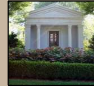
12-16 CRYPTS: FROM $350,000