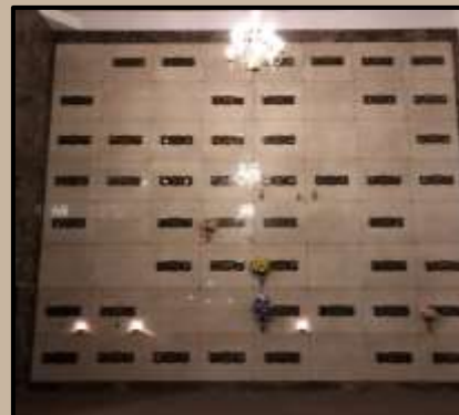
NICHES/COLUMBARIUM FOR ASHES & URNS