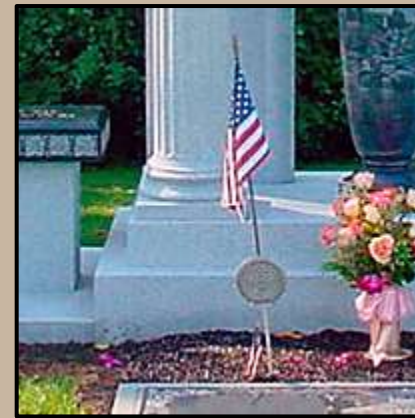
FLAGHOLDERS AND FLAGS