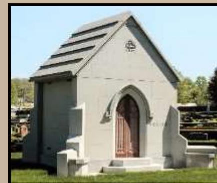
WALK-IN MAUSOLEUMS have a working door and an interior space for the family to visit. The crypts are on the inside. It can have niches or a columbarium for cremated remains, and places for personal art and artifacts.