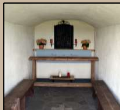
BENCHES, TABLE, ARTIFICIAL FLOWERS