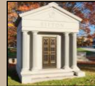
6-8 CRYPTS: FROM $145,000