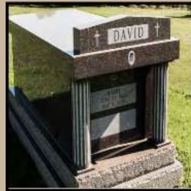
SINGLE CRYPT LAWN STYLE MAUSOLEUMS sit at ground level and have one crypt for one body.

There are three basic types of mausoleums: Above Ground Burial Vaults (Lawn Style), Garden or Outdoor Mausoleums, and Estate Walk-in and Non Walk-in Mausoleum Buildings. When deciding which type is right for your family, you'll need to take into consideration the number of family members you expect to be interred, the style you prefer, your budget, and the availability and requirements of spaces in your cemetery. Above ground burial vaults can contain any number of crypts and be for any number of people.