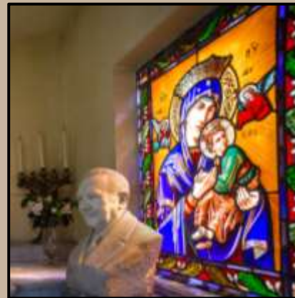
STAINED GLASS WINDOWS

You've designed your dream mausoleum. Now it's time to decorate it with your choice of mausoleum accessories. Let's take a look at some of your mausoleum design options, decorations and accessories for modern private family mausoleums and interiors.