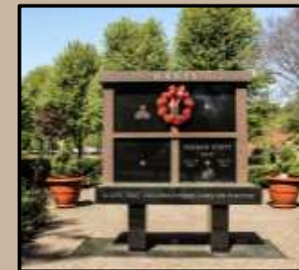
4 CRYPT: FROM $40,000