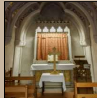
ALTAR AND PRAYER KNEELERS