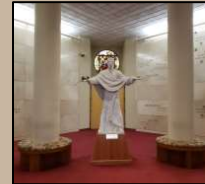
STATUES & SCULPTURES