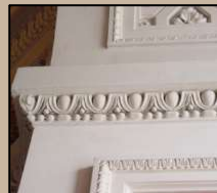
EGG AND DART DECORATIVE SCULPTURE