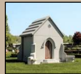
CHAPEL STYLE: FROM $400,000