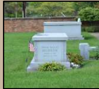
1 CRYPT: FROM $15,000