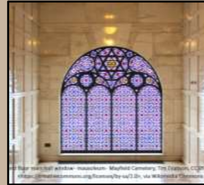
STAINED GLASS WINDOWS