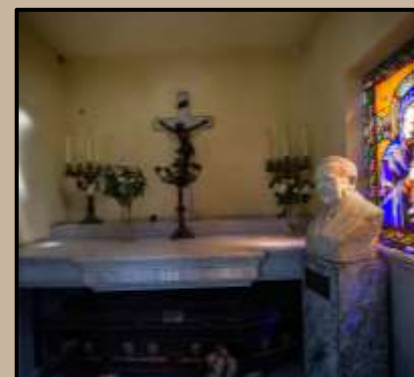
RELIGIOUS ART & BUSTS