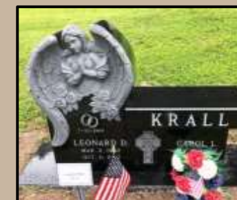
RELIGIOUS IMAGES & SYMBOLS