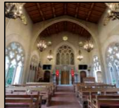
CHAPEL ROOM WITH ALTAR & PEWS