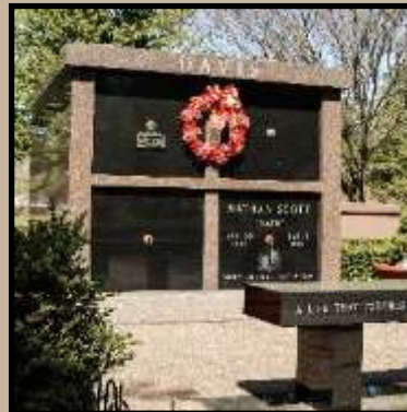
MULTI-CRYPT LAWN STYLE MAUSOLEUMS are ground level structures that hold more than one body. They can be as simple or as decorative as you like.