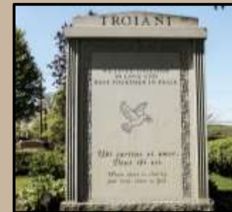
8 CRYPT: FROM $65,000