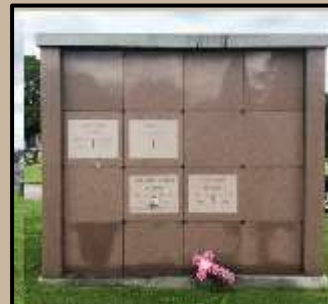
8-16 CRYPT: FROM $65,000