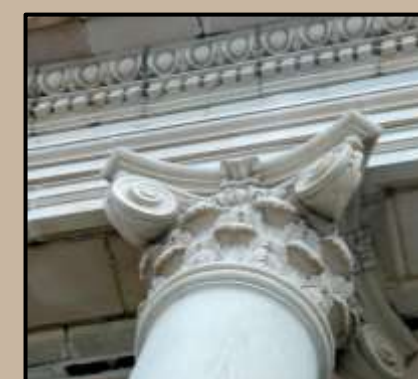
SCULPTED COLUMN CROWNS