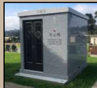
2-4 CRYPTS: FROM $109,000