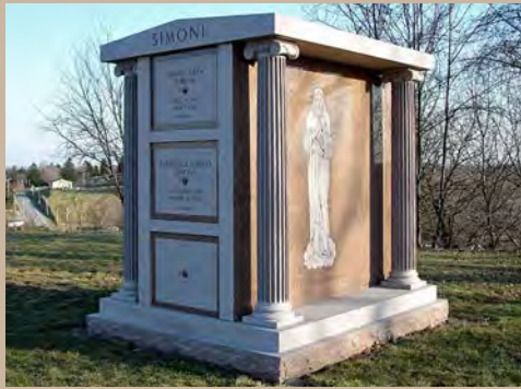
3 Crypt Mausoleum

Entry Level Double-Crypt Private Mausoleums: Starting at $29K