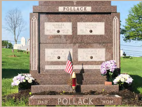
4 Crypt Mausoleum