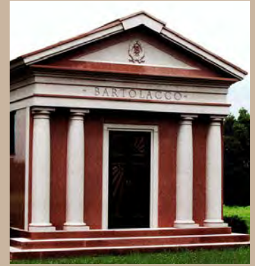
16-Crypt Walk-In Mausoleum

Walk-in mausoleums are buildings that contain the crypt or crypts of many family members. They have doors and interior space for visitors to be comfortable and protected from the elements year round. Inside your mausoleum, you can display photographs, murals, and personal artifacts that tell the story of your life.