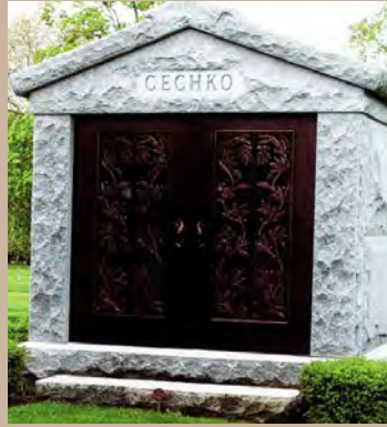
6-Crypt Walk-In Mausoleum