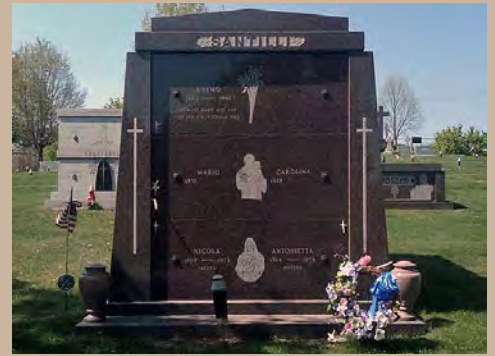
6 Crypt Mausoleum