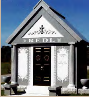
2-Crypt Walk-In Mausoleum