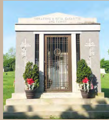
9-Crypt Walk-In Mausoleum